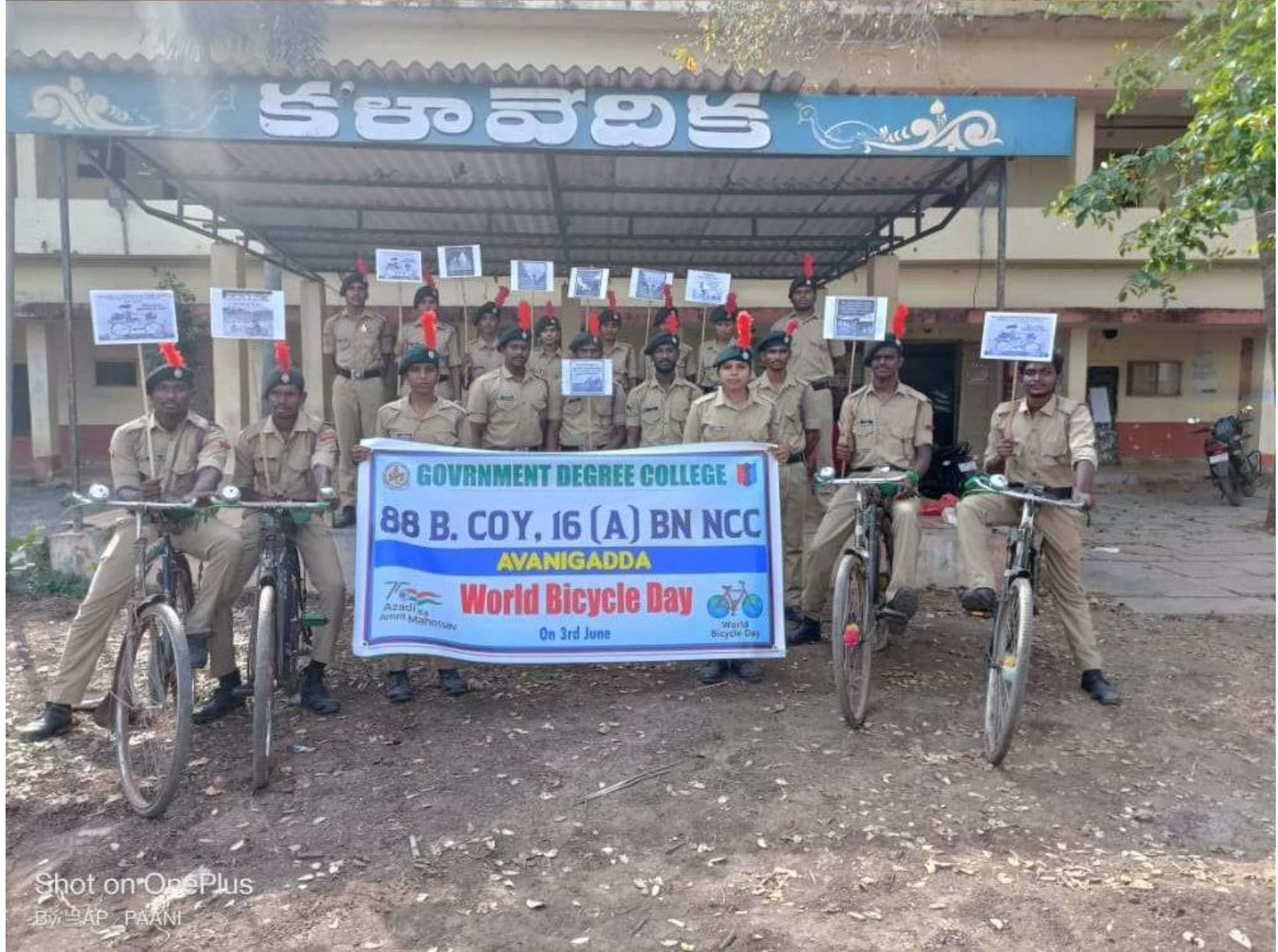
In the Part Of Azadi Ka Amrit Mahostav Word Bicycle Day Our NCC Cadets are in Our College Campus