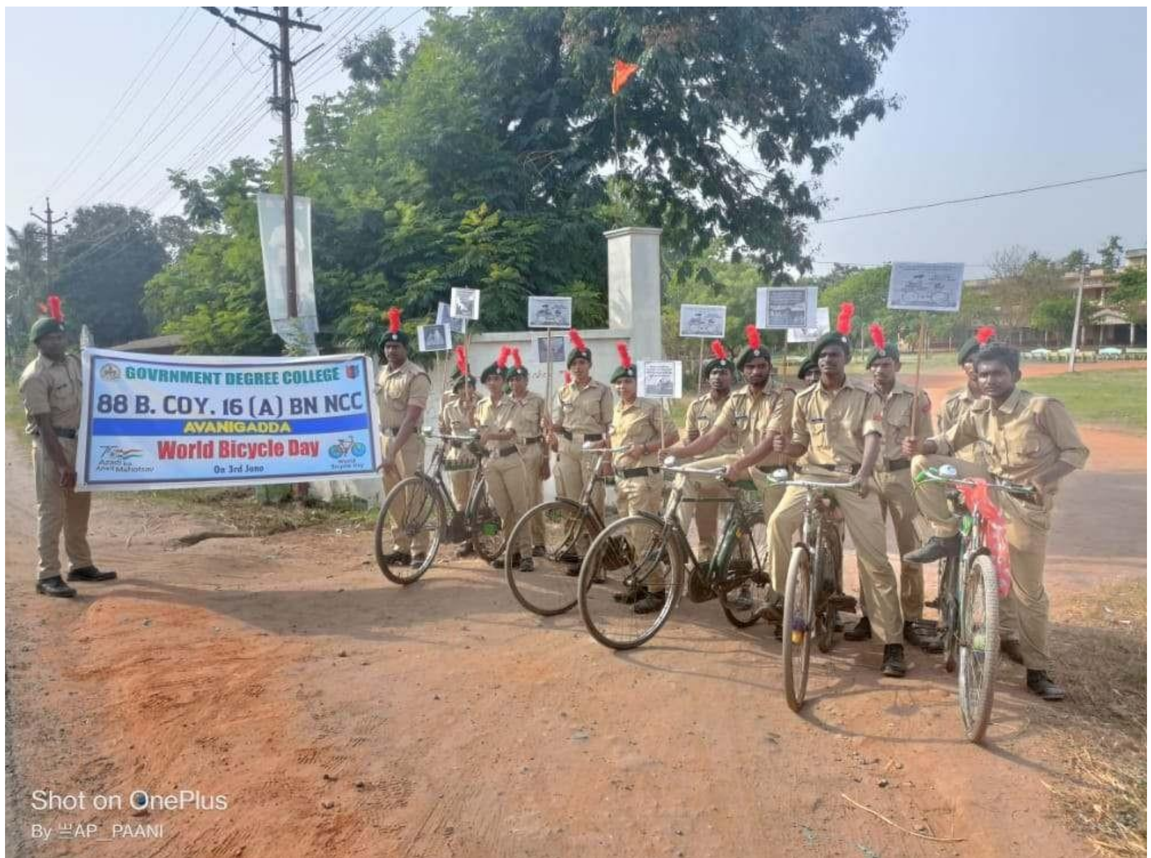
Our NCC Cadets are in the Part Of Azadi Ka Amrit Mahostav Word Bicycle Day